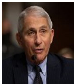
Dr. Anthony Fauci

Director of the National Institute of Allergy and Infectious Diseases